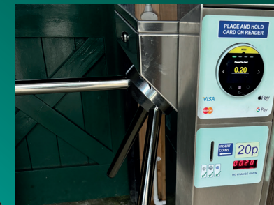
Coin and Contactless Payment Entry Systems

Our approved partners manufacture the controllers, and readers, which gives our customers access to a global payments gateway, whilst still providing a personal and professional service.