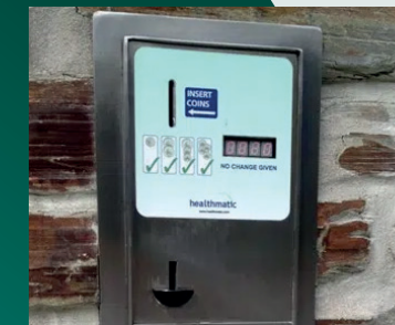
Coin Payment entry system