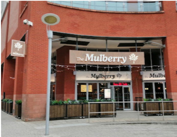
The Mulberry Belgrade Plaza, Upper Well St, Coventry Pub Classics 0.8 Miles