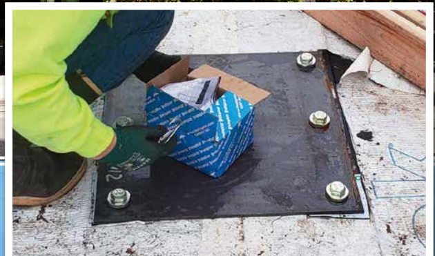
No on-site drilling or welding was required