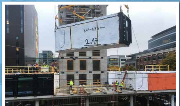
Each module unit weighed 18,144kgs