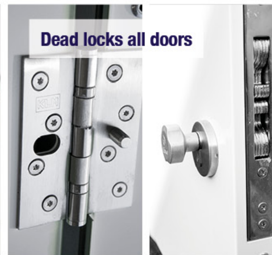
Dead locks all doors