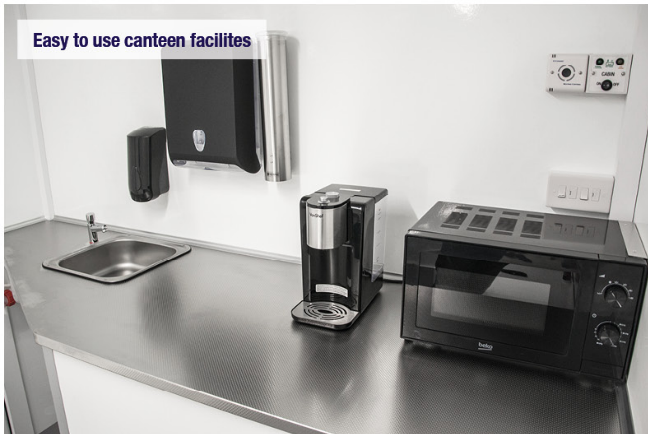
Easy to use canteen facilities